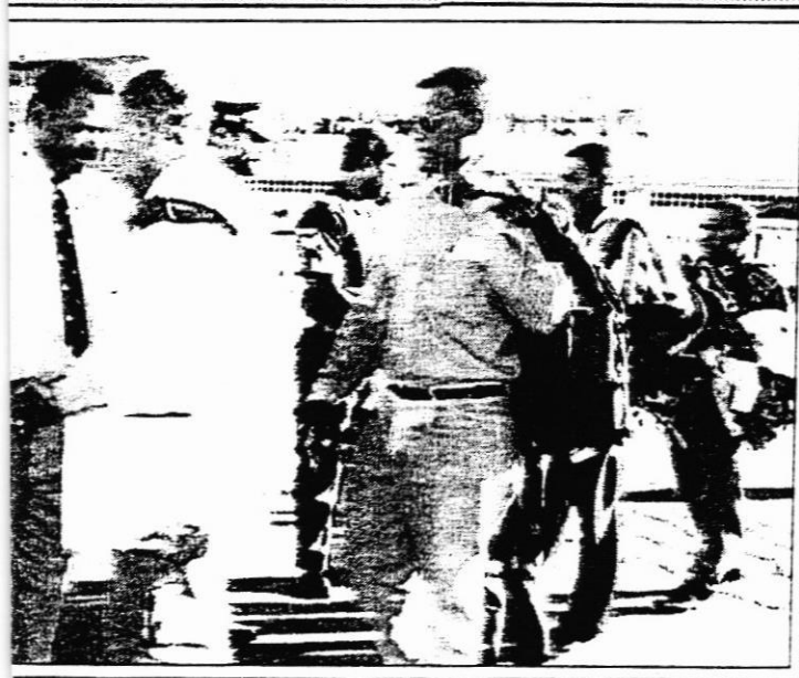
group departing Bauerfield Airport